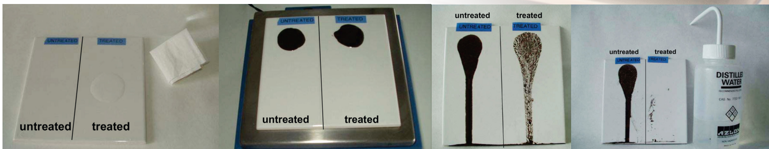
1- ProClean Image applied to 1 tile, half treated half untreated.