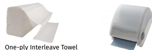
One-ply Interleave Towel

'Auto Cut' dispenser with auto-cutting mechanism.